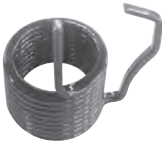
Enamel copper Section 4x2,5mm Diam 35mm, Ht 27mm without outputs