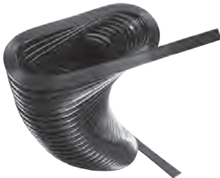
Enamel copper Section 9 x 1,8 mm 50 x 110 x 65 mm