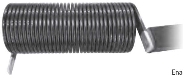
Enamel copper Section 8 x 2,5 mm Diam. 40 Lg 95 mm